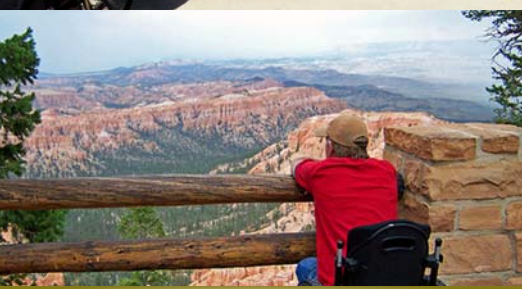
Bryce Canyon National Park overlook