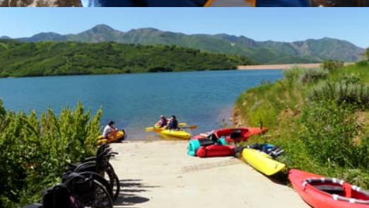
Kayaking at Little Dell Reservoir