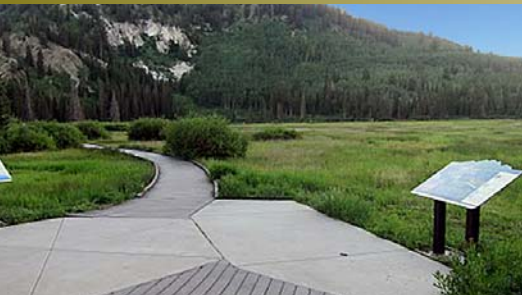
Silver Lake boardwalk at Solitude, Big Cottonwood Canyon

www.campk.org , information@campk.org , 801-582-0700