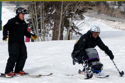
Adaptive downhill skiing, Snowbird