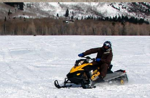
Snowmobiling in the Uinta-Wasatch-Cache National Forest