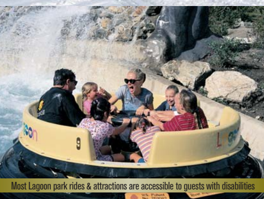
Most Lagoon park rides & attractions are accessible to guests with disabilities