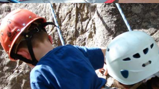
Rock climbing at Storm Mountain, Salt Lake County