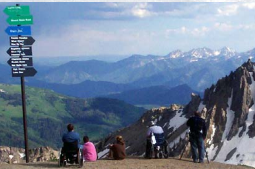
View of the Wasatch from 11,000 feet via Snowbird Tram