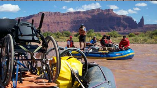
Running the Colorado River